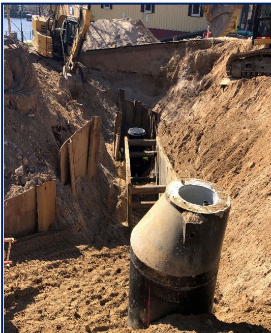
Fig 1: Sanitary work continues into Mahan Park