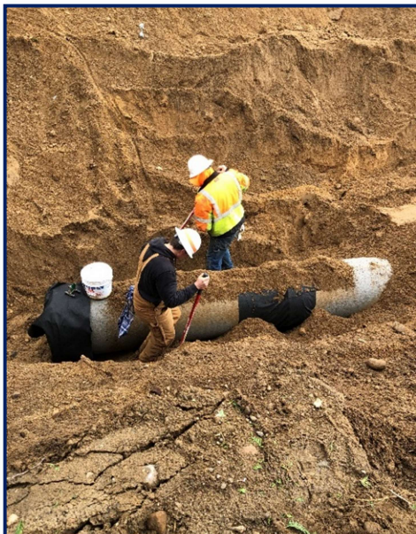
Fig 2: Storm sewer installation progressing along Brady St.