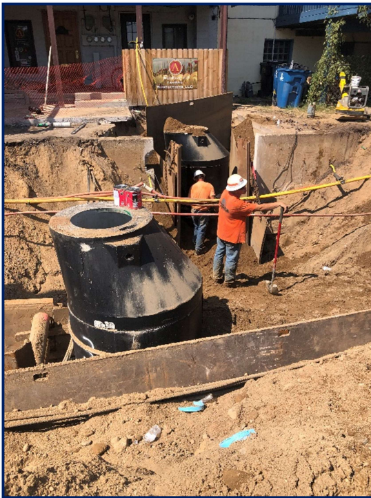
Fig 2: New sanitary sewer manholes are installed on Riverfront Plaza