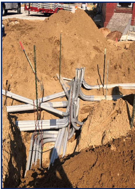
Fig 2: Severance prepares conduit sweeps for electrical handholes