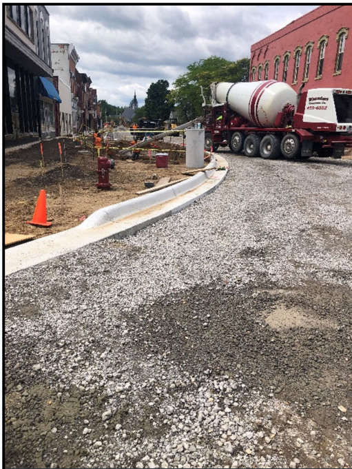
Fig 2: Pouring sidewalk on Brady St