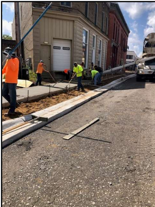
Fig 2: Duran Concrete forms and pours sidewalk on Hubbard St.