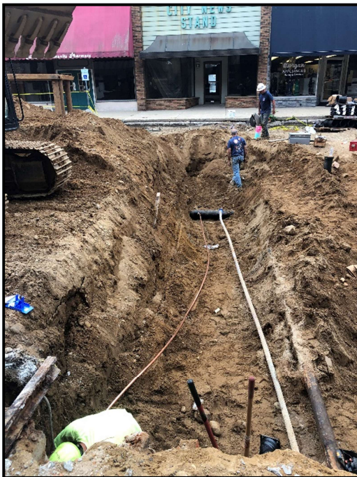
Fig 2: Milbocker continues to replace water services along Locust St