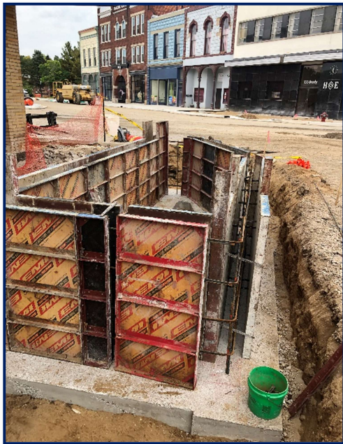
Fig 2: Once the footing is poured, concrete forms are raised to continue building seat wall planters throughout the project.