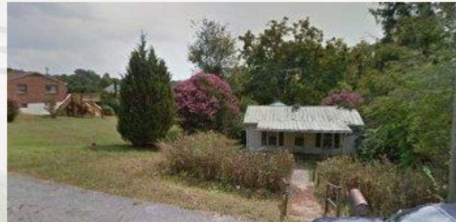
Street View September 2015