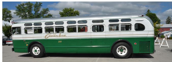
Thanks, TANK for loaning us a restored 1950 Green Line bus.