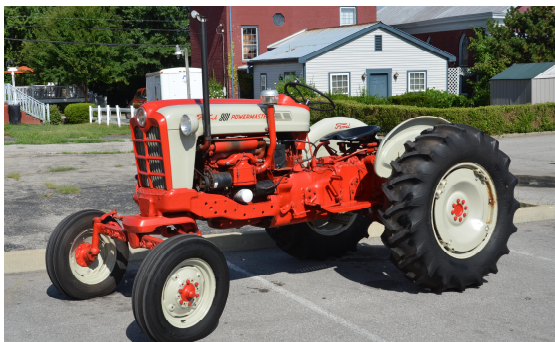
Butch Wainscott's Ford 901 Powermaster Tractor