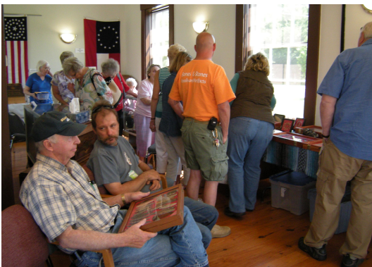
Lots of folks attended the museum exhibit of Native American and archaeological artifacts.