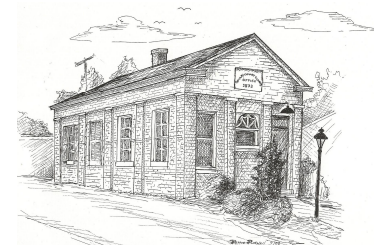
Artwork by Pattie Purnell

2965 Gallatin Street, Burlington, KY 41005.