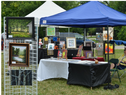
Members of the Boone County Visual Arts Association displayed their artwork.