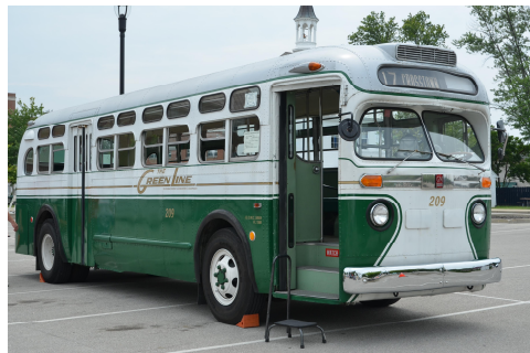
This Green Line bus dating from the 1950s was exhibited during Boone County Heritage Day and Chalkfest.