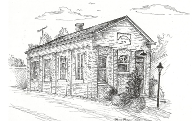
Artwork by Pattie Purnell

2965 Gallatin Street, Burlington, KY 41005.