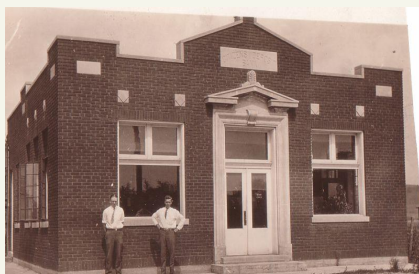
Citizens' Deposit Bank of Grant, KY, organized in 1909, building erected in 1927.