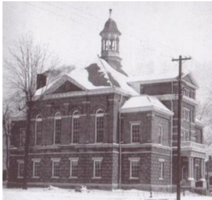
Historic Courthouse in 1930