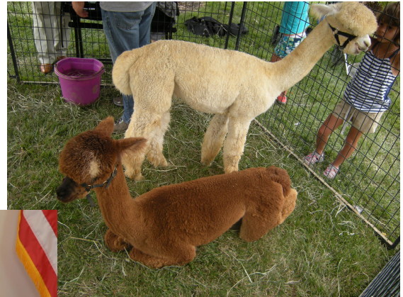
Alpacas and old time cars! So much to see!