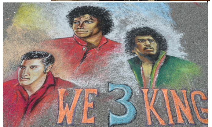
Chalk Art ... it's amazing what these young folks can do with chalk on blacktop! By Buck Turner of Burlington.