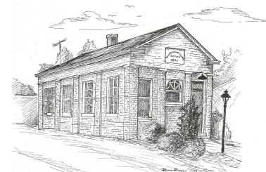
Artwork by Pattie Purnell

2965 Gallatin Street, Burlington, KY 41005.