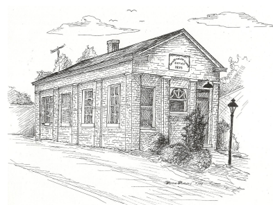
Artwork by Pattie Purnell

ceed westbound 4.6 miles, turn right at the first traffic signal (Bullittsville-Burlington Road aka Garrard St.); turn left into the Boone County Administration Building parking lot. The Museum is the small white brick building marked "County Court Clerk's Office...1853" The street address is 2965 Gallatin Street, Burlington, KY 41005.