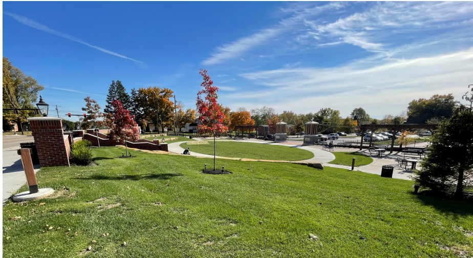
New Burlington Commons Park

This year, the Parks department will have a Christmas Tree lighting event on Saturday, December 4th between 4:00 and 7:00 pm at the newly completed Burlington Commons which is located across Burlington Pike from the Boone County Administration building. Refreshments including snacks and hot Cocoa will be served.