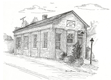
Artwork by Pattie Purnell

Burlington Road aka Garrard St.); turn left into the Boone County Administration Building parking lot. The Museum is the small white brick building marked "County Court Clerk's Office...1853" The street address is 2965 Gallatin Street, Burlington, KY 41005.