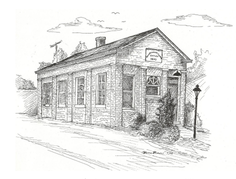
Artwork by Pattie Purnell

Burlington Road aka Garrard St.); turn left into the Boone County Administration Building parking lot. The Museum is the small white brick building marked "County Court Clerk's Office...1853" The street address is 2965 Gallatin Street, Burlington, KY 41005.