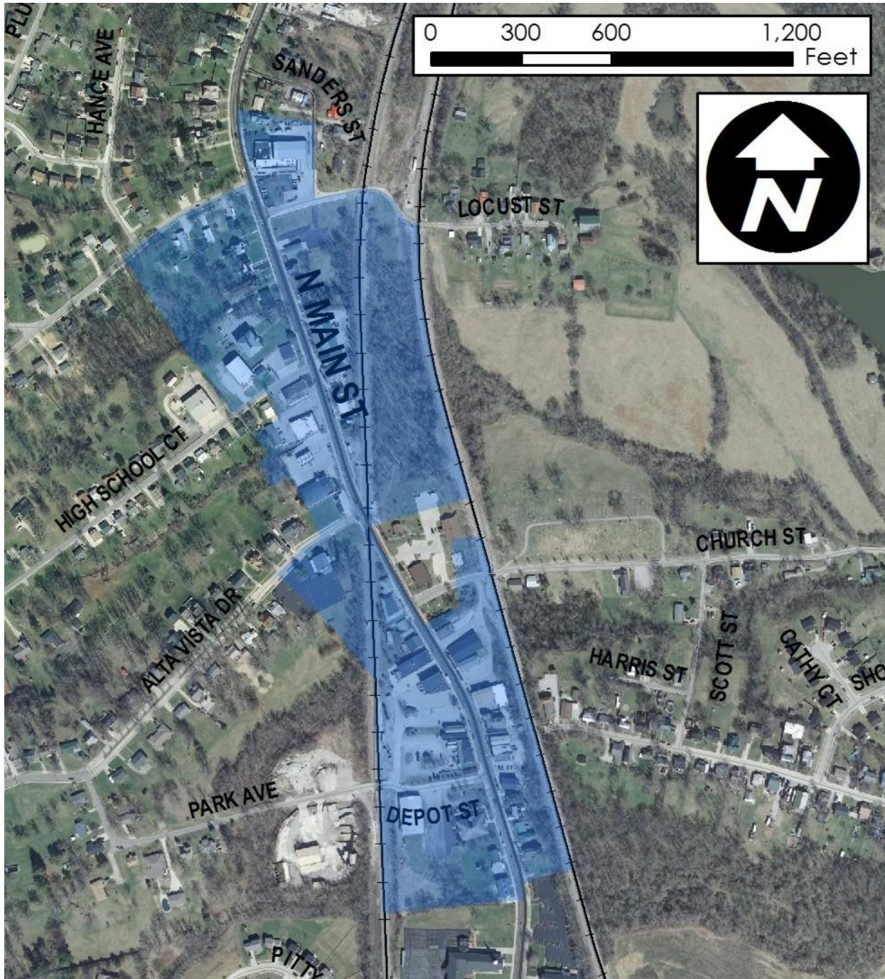
Figure 1 - Walton Downtown (WD) Zoning District

in a small town environment, and that the area's character and needs did not correlate to the requirements of the C-2 zone in place at that time. The WD zoning district was designed to encourage continued growth of the mixed-use central business district in a manner that maintained Walton's small town character along Main Street. In addition, streetscape improvements were made to Main Street in that same general time frame.