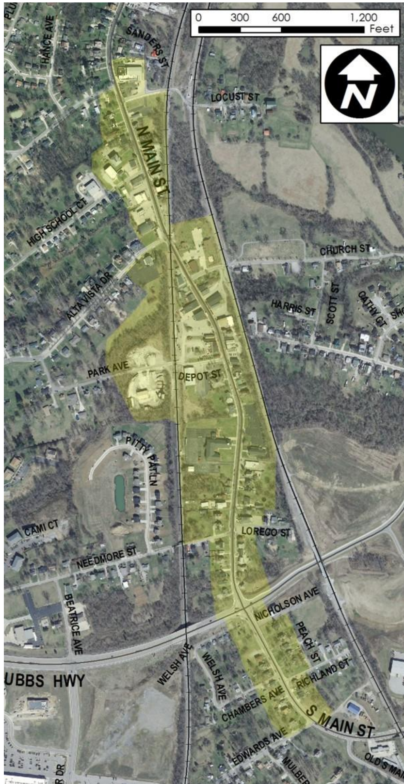
Figure 4 - Walton Main Street Strategic Plan Study Area