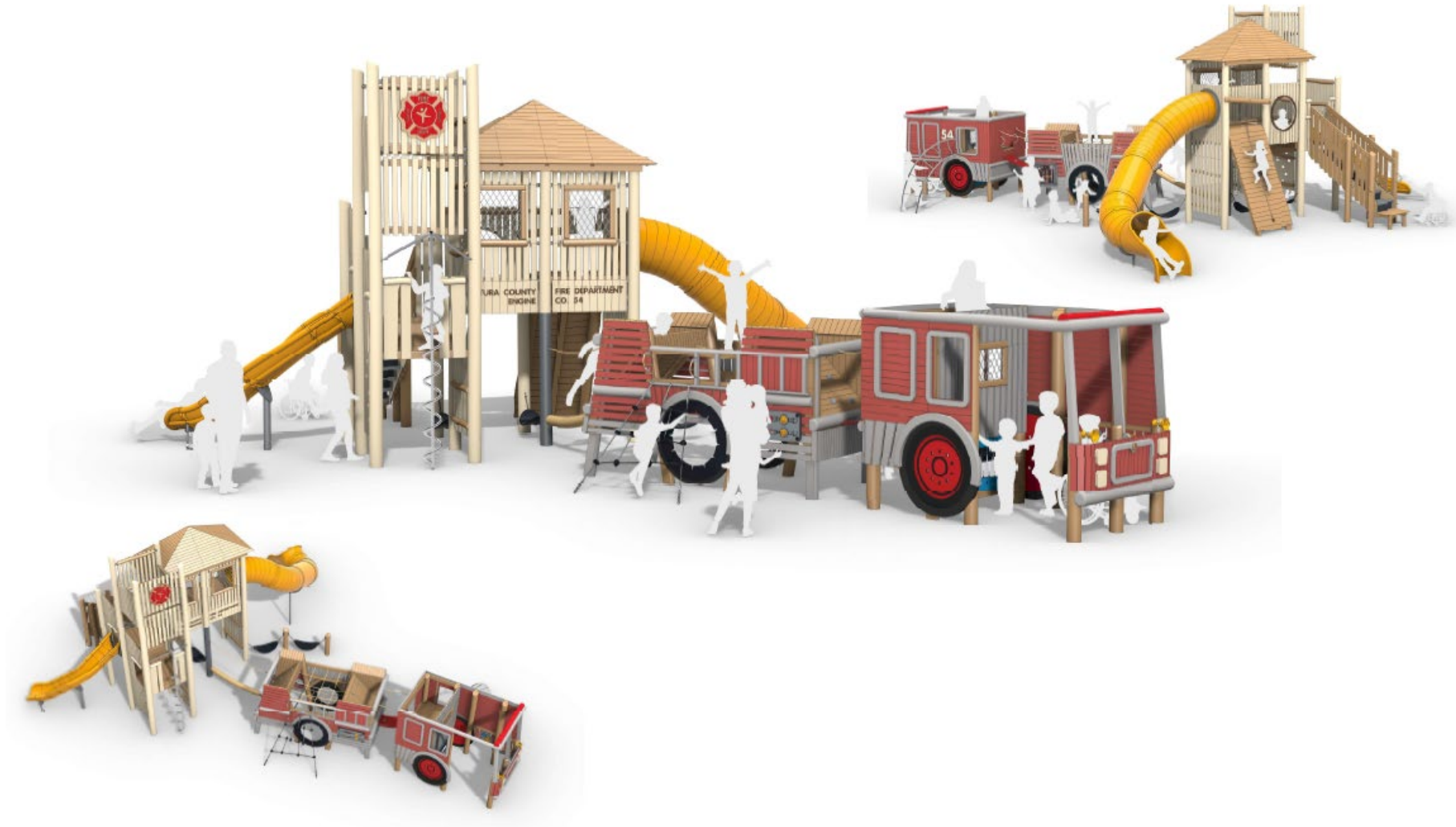
Fire Station-Themed Play Structure