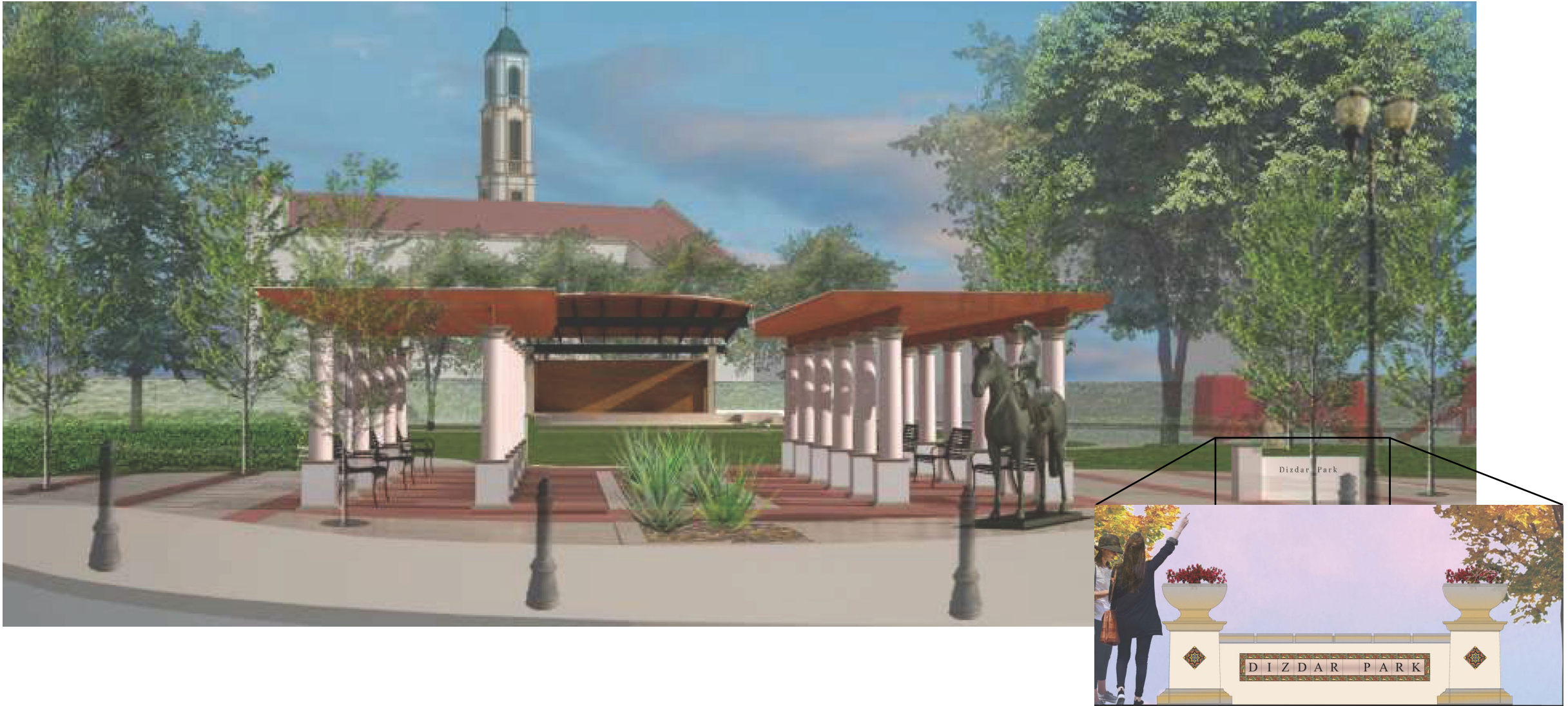
Main Entrance (Ventura Blvd. & Glenn Dr.)