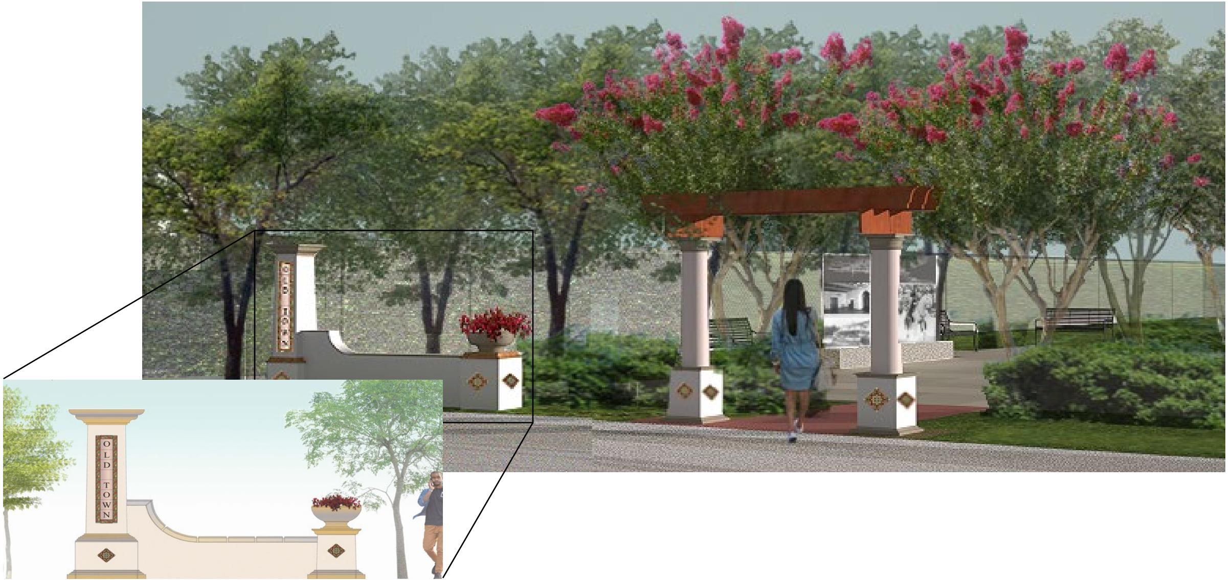
Garden Entry Gateway (Ventura Blvd.)