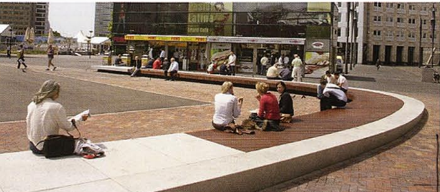
COMMUNITY BENCH CONCEPT