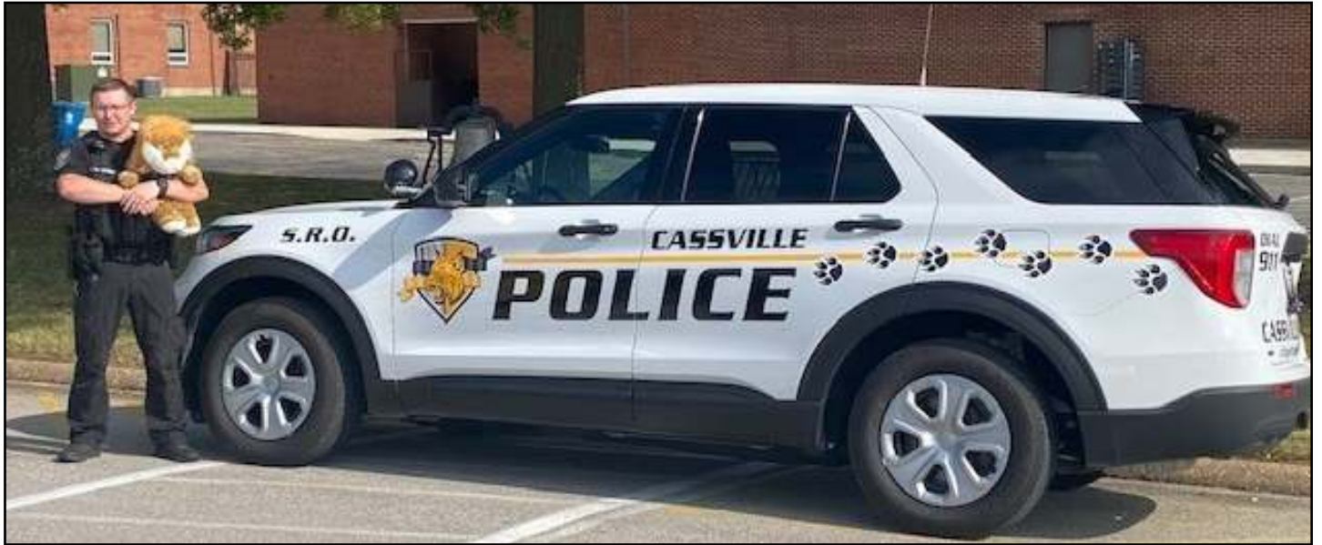
SRO/D.A.R.E. Officer, with D.A.R.E. mascot Daren the Lion, and the newly decked out D.A.R.E. vehicle