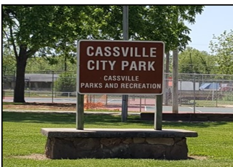
Downtown City Park

baseball fields surfaces with new clay added on an as needed basis every two to three years, repairs to tennis, basketball and pickle ball courts, repair lighting at horseshoe pits, replace bathrooms to provide ADA accessibility, adding restroom facilities open year round to each trail head if possible, relocate baseball field #2, restore pedestrian and/or vehicular access to the park from 7 th Street—alternative consideration given to improving Park Road and Mineral Springs Road.