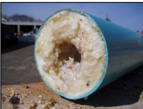
Pipe clogged with FOG