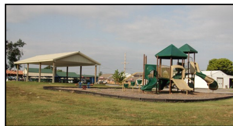
Mill Street Playground

lack of restrooms (43%) and playground equipment (14%). Behavioral concerns of other park users (safety, vandalism) was cited in 35% of the responses. Illicit or illegal activities was also a frequently mentioned theme in open ended replies.