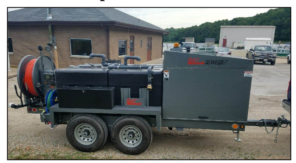
New Sewer Jetter

The City's Wastewater Division has taken delivery of a new sewer