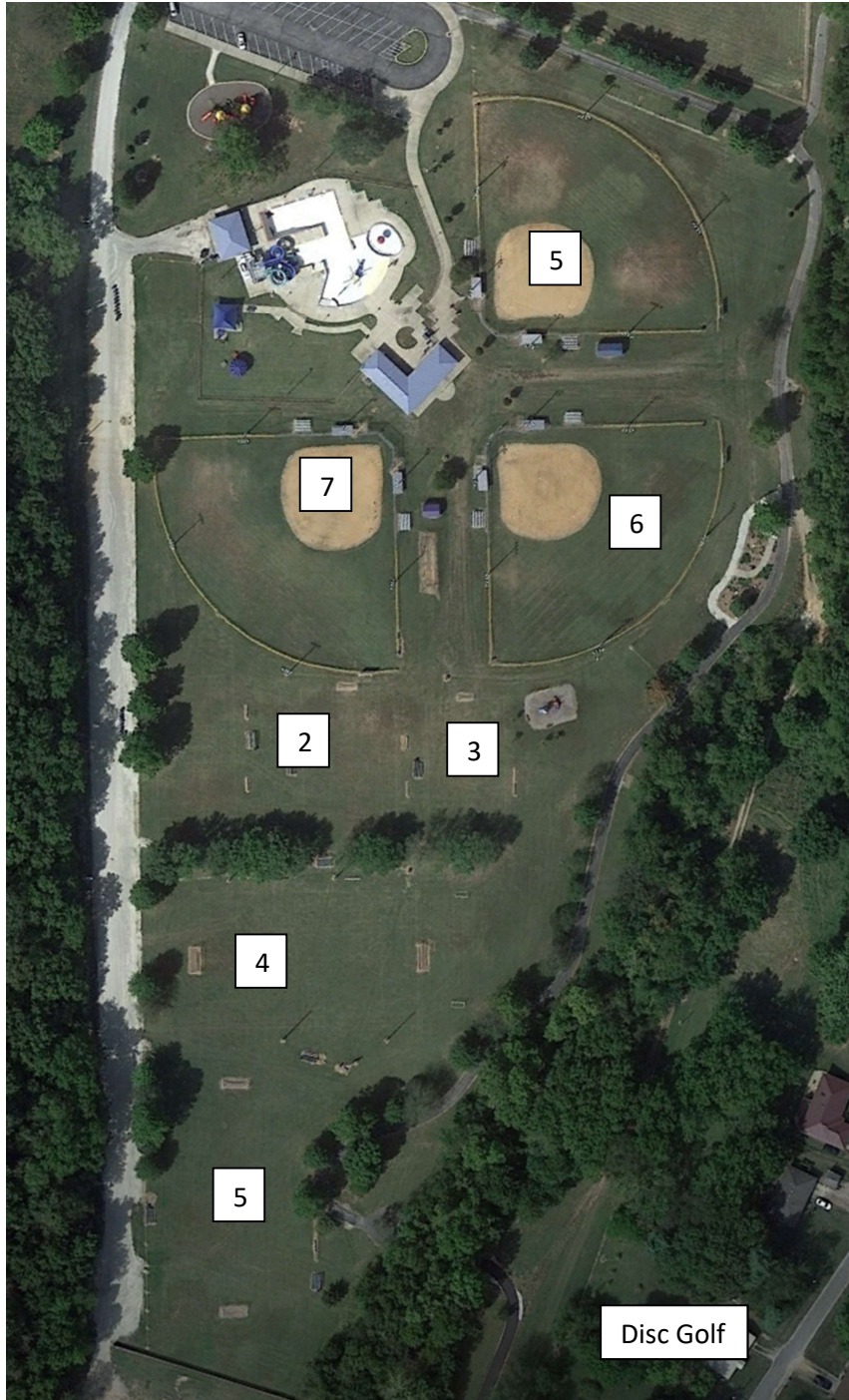
South Park Softball fields 5, 6 and 7 Soccer fields 2 through 5