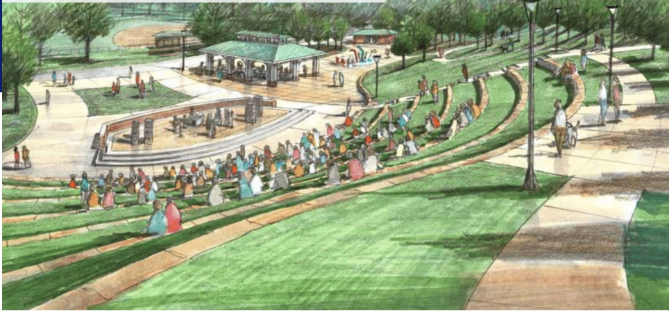
Yoctangee Park (South) Proposed Rendering

Chillicothe's last comprehensive plan was completed in 1948. Since then, the City has experienced significant growth and change. The Choose Chillicothe process set to create, a new, modern comprehensive plan for the City of Chillicothe. Public input was fundamental in the 12-month process. A 38-person Steering Committee representing the diversity of the community was selected to drive the process and hundreds of residents, stakeholders, and community leaders contributed their energy and ideas throughout 2022 at more than 10 engagement opportunities. The result is a collaborative vision for the city, a set of seven goals and 73 plan actions, and three concept site plans to be completed over the next 10 years.