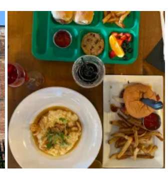
5. The Trolley