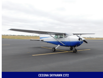
CESSNA SKYHAWK C172