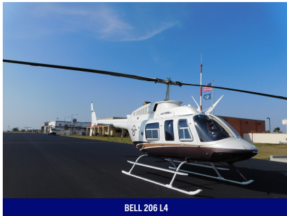
BELL 206 L4

THANK YOU TO OUR CUSTOMERS. WE APPRECIATE YOU AND YOUR BUSINESS. FLY SAFE!