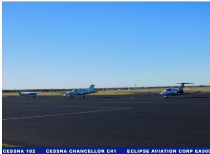
CESSNA 182 CESSNA CHANCELLOR C41 ECLIPSE AVIATION CORP EA500