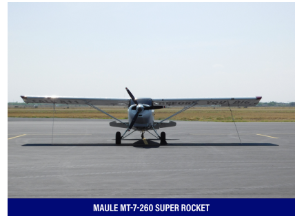
MAULE MT-7-260 SUPER ROCKET