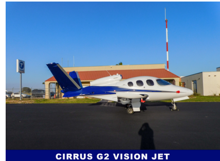
CIRRUS G2 VISION JET