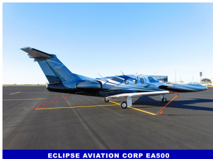
ECLIPSE AVIATION CORP EA500