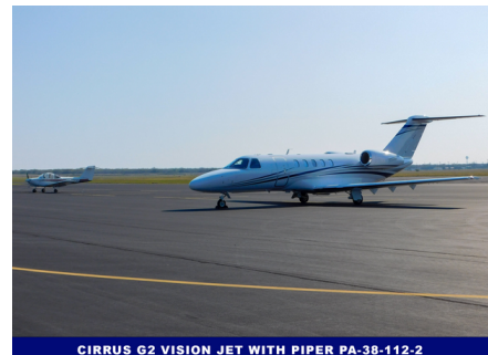
CIRRUS G2 VISION JET WITH PIPER PA-38-112-2