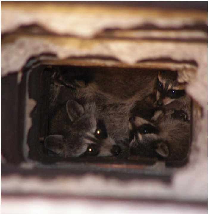
People may be surprised to find raccoon families denning in their chimney, yet this is a rather common occurrence. We urge people to cap their chimneys if they don’t want unexpected guests, even if this is just a temporary fix until the final and more major repair can be done by a professional.

Acceptable euthanasia methods are those approved by the American Veterinary Medical Association, which include: carbon dioxide chamber (CO 2 ), proper carbon monoxide (CO) chamber (NOT car exhaust), gunshot where firearm discharge is legal, or lethal injection by veterinarian. The NWCO must agree to follow the most recent AVMA Guidelines on Euthanasia (see most recent Euthanasia Panel Report of the AVMA), excepting any extenuating circumstances that involve human health or safety.