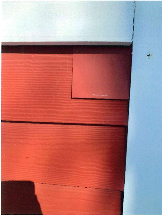
Match Existing Restaurant Paint Colors