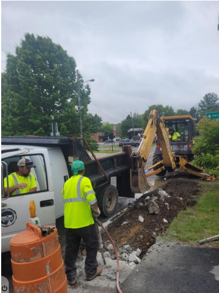
East of Maui sidewalk