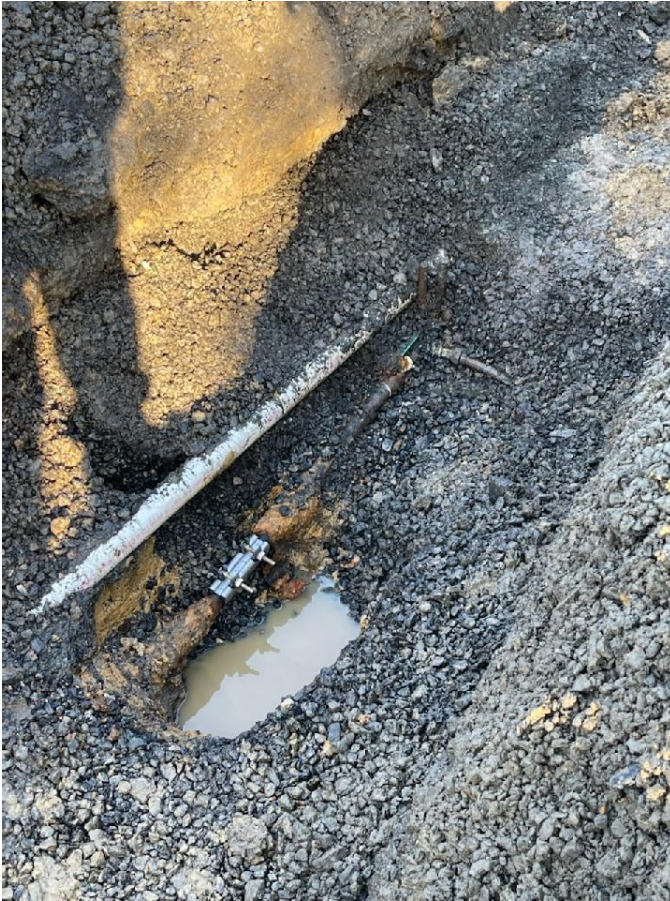
Main Street leak repair