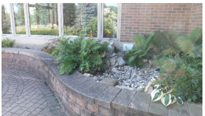
19 – Library, DM Bed