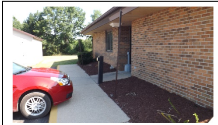
23 – Comm Ctr, Side