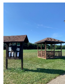
9 – West Park, Gazebo