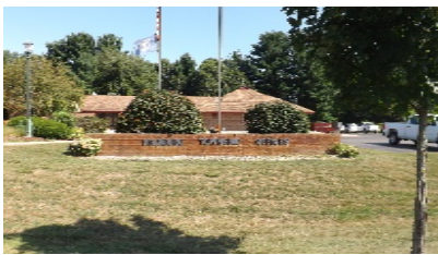
4 – Township Sign, Hall