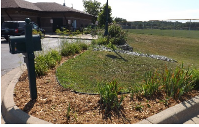
11 – Library, Mailbox