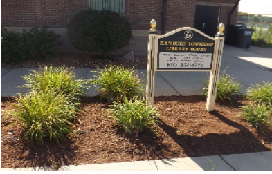
14 – Library, Front Sign