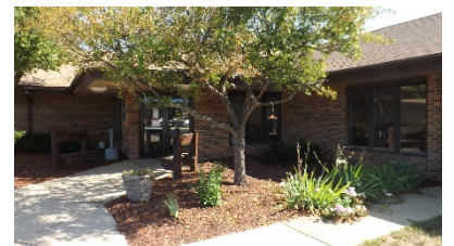
21 – Comm Ctr, Entry