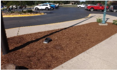
16 – Library, Sidewalk