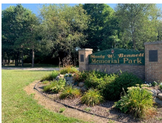
7 – Township Sign, Manly