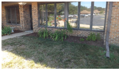
20 – Comm Ctr, Window