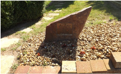
17 – Library, DM Entry