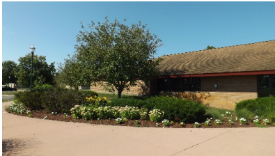
1 – Township Hall, Front