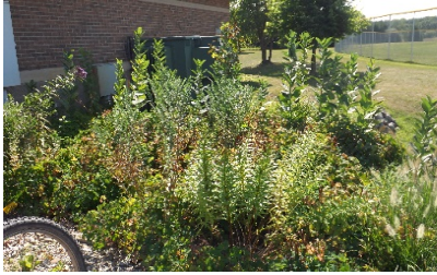
13 – Library, Bike Rack