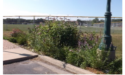
12 – Library, Lightpole