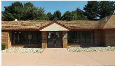
2 – Township Hall, Pots