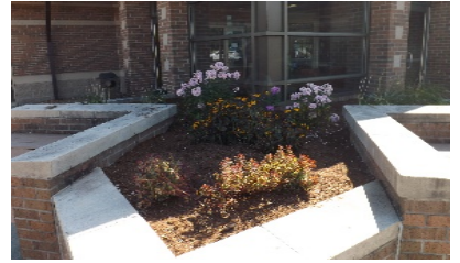
15 – Library, Ft Garden