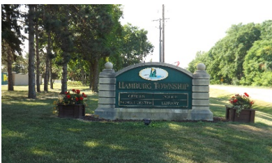
5 – Township Sign, North