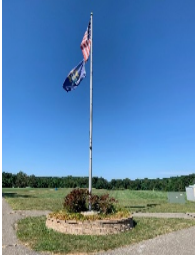
10 – West Park, Flagpole