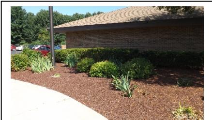
22 – Comm Ctr, Sidewalk