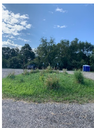
8 – Pettysville Trailhead