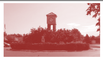
24 – Fire Stations, Pics to follow

Township will work with each resident/group that adopts a garden to determine the plants and or supplies that are needed. Donated materials/supplies are desired, however, the Township will provide anything that is needed.