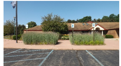
3 – Township Hall, Sidewalk