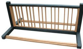
Model BR-200 | Cedar/Black

No need to paint. Recycled plastic lumber will not rust. This bicycle storage rack known for its durable and maintenance-free properties. Available in attractive colors to complement any architectural flavor. Constructed to store up to ten bicycles.