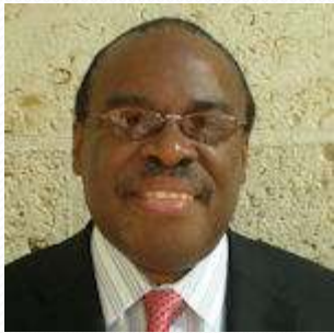
Carl Davis Central