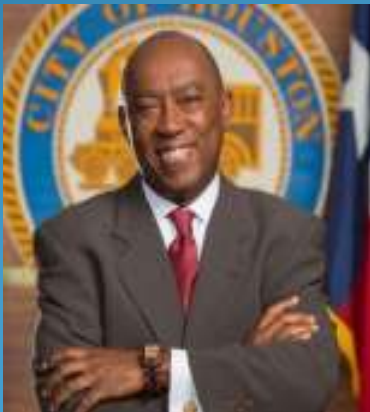
Mayor Sylvester Turner

working to uphold S.U.P.E.R. standards of Service, Unity, Professionalism, Excellence and Responsiveness!