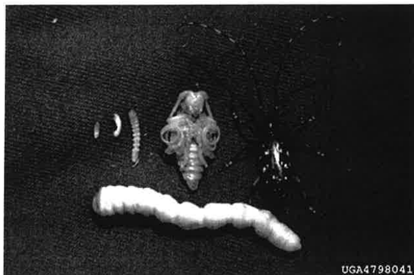
ALB Life Stages