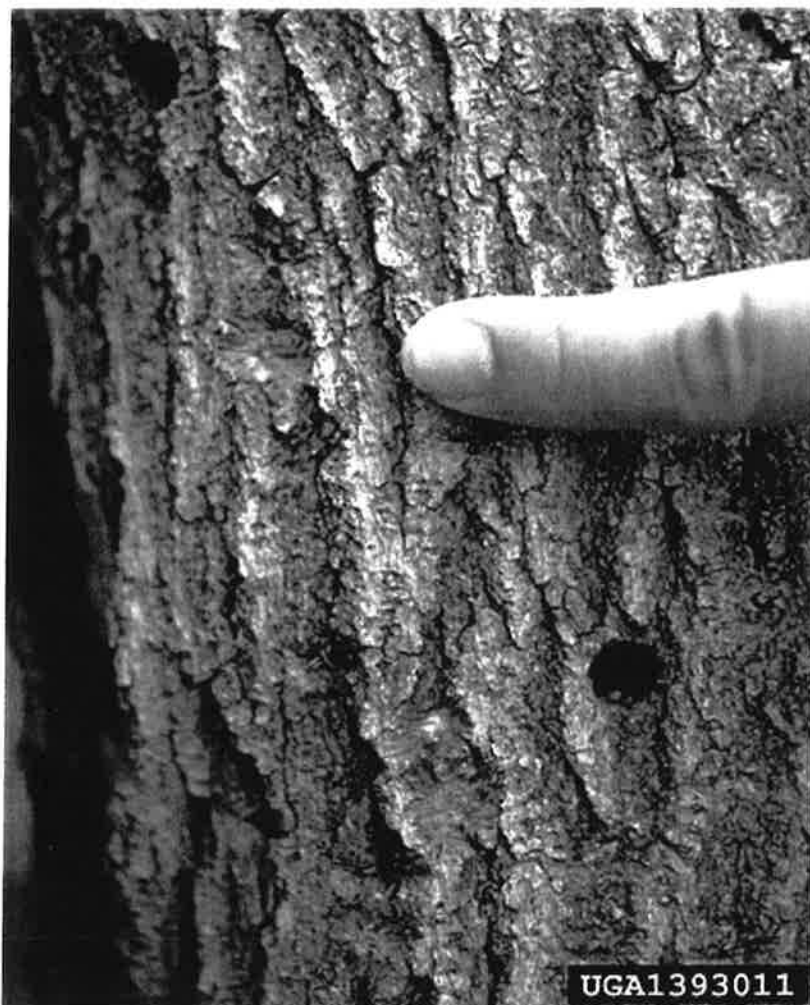
ALB egg pits and exit hole