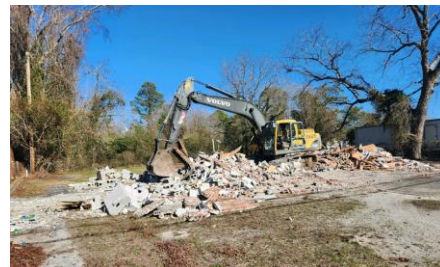
Demolition 2602 Oaks Road