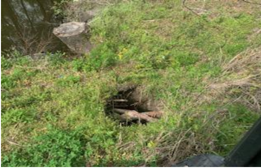
Old Airport Rd. Before