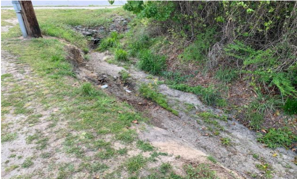
Brunswick Ave. Before