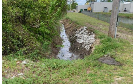
Brunswick Ave. After