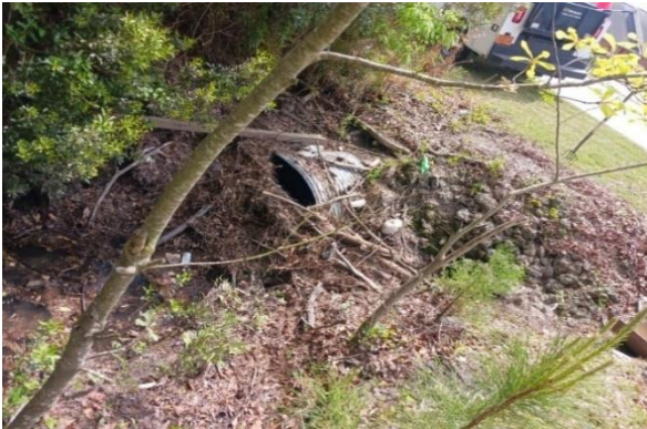
Red Robin Lane Before