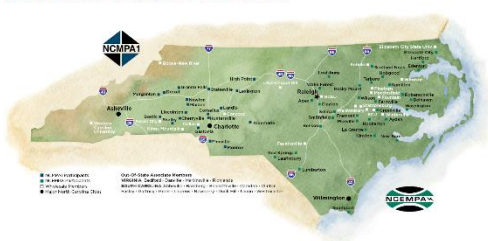
North Carolina Public Power Communities