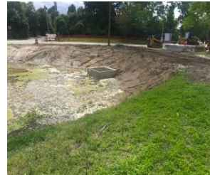
Biddle Street Pond