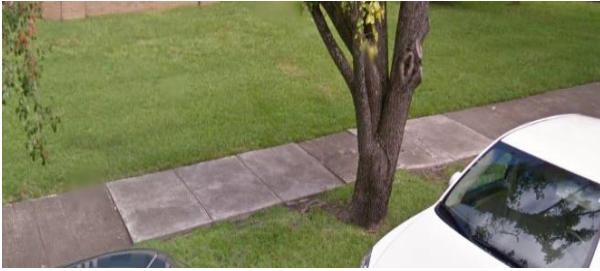
Middle Street Before