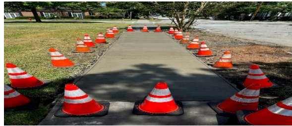
Middle Street After