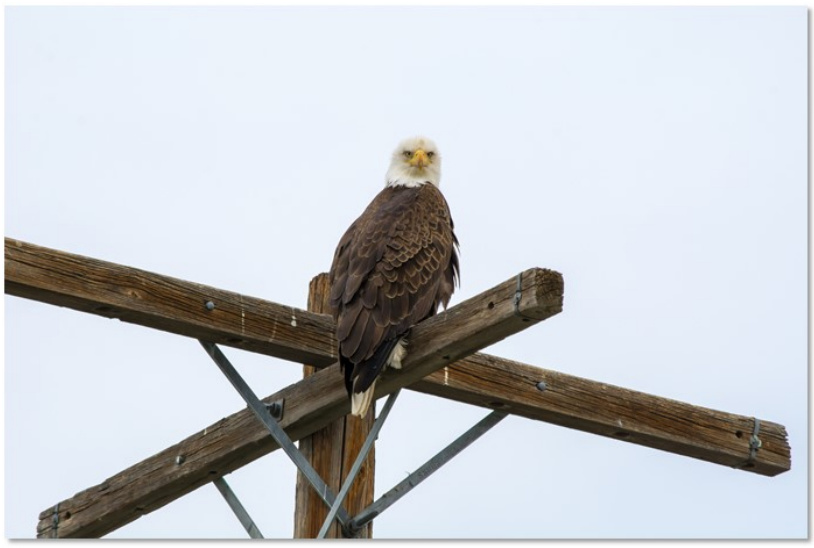
Bald Eagle at Standley Lake

Periodically, city crews flush every fire hydrant along the 110 miles of water mains in Northglenn to remove debris in the form of sand particles or pipe scale. Small amounts of iron and manganese may temporarily discolor your water during this process, but this is not harmful. If you notice a rusty tinge to your water, open all your faucets at the same time for a few minutes until the water runs clear.