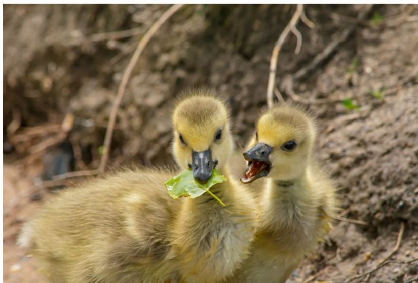
Canada Geese goslings at Standley Lake

----- Northglenn City Council provides opportunity for public input and meets at 7 pm on the 2 nd and 4 th Mondays of each month. Meetings are open to the public and take place in Council Chambers at City Hall, 11701 Community Center Drive. Please see Northglenn.org for contact information for your Ward Council Member. We want you, our valued customer, to be informed about the services we provide and the quality water we deliver to you every day.