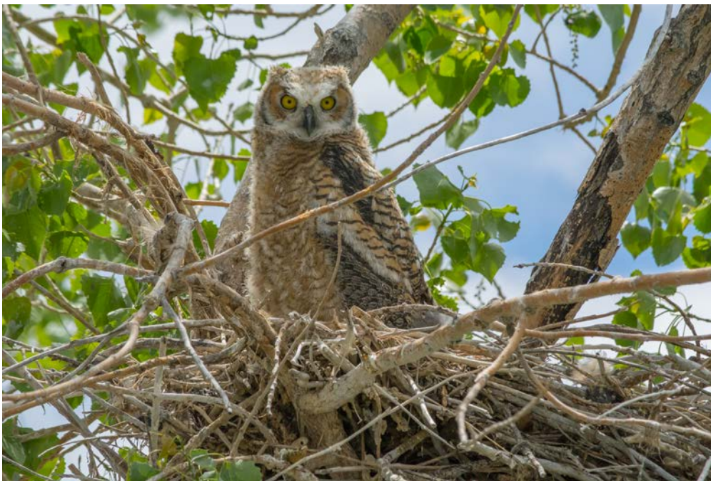
Great Horned Owl at Standley Lake