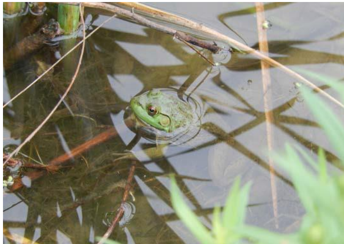
Frog at Croke Reservoir