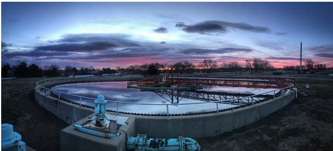
Clarifier at the Water Treatment Facility

Northglenn City Council provides opportunity for public input and meets at 7 pm on the 2 nd and 4 th Mondays of each month. Meetings are open to the public and take place in Council Chambers at City Hall, 11701 Community Center Drive. Please see Northglenn.org for contact information for your Ward Council Member. We want you, our valued customer, to be informed about the services we provide and the quality water we deliver to you every day.