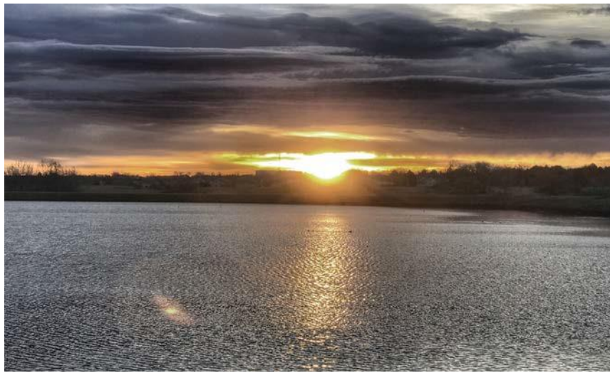
Northglenn Terminal Reservoir

Periodically, city crews may flush every fire hydrant along the 110 miles of water mains in Northglenn to remove debris in the form of sand particles or pipe scale. Small amounts of iron and manganese may temporarily discolor your water during this process, but this is not harmful. If you notice a rusty tinge to your water, open all your faucets at the same time for a few minutes until the water runs clear.