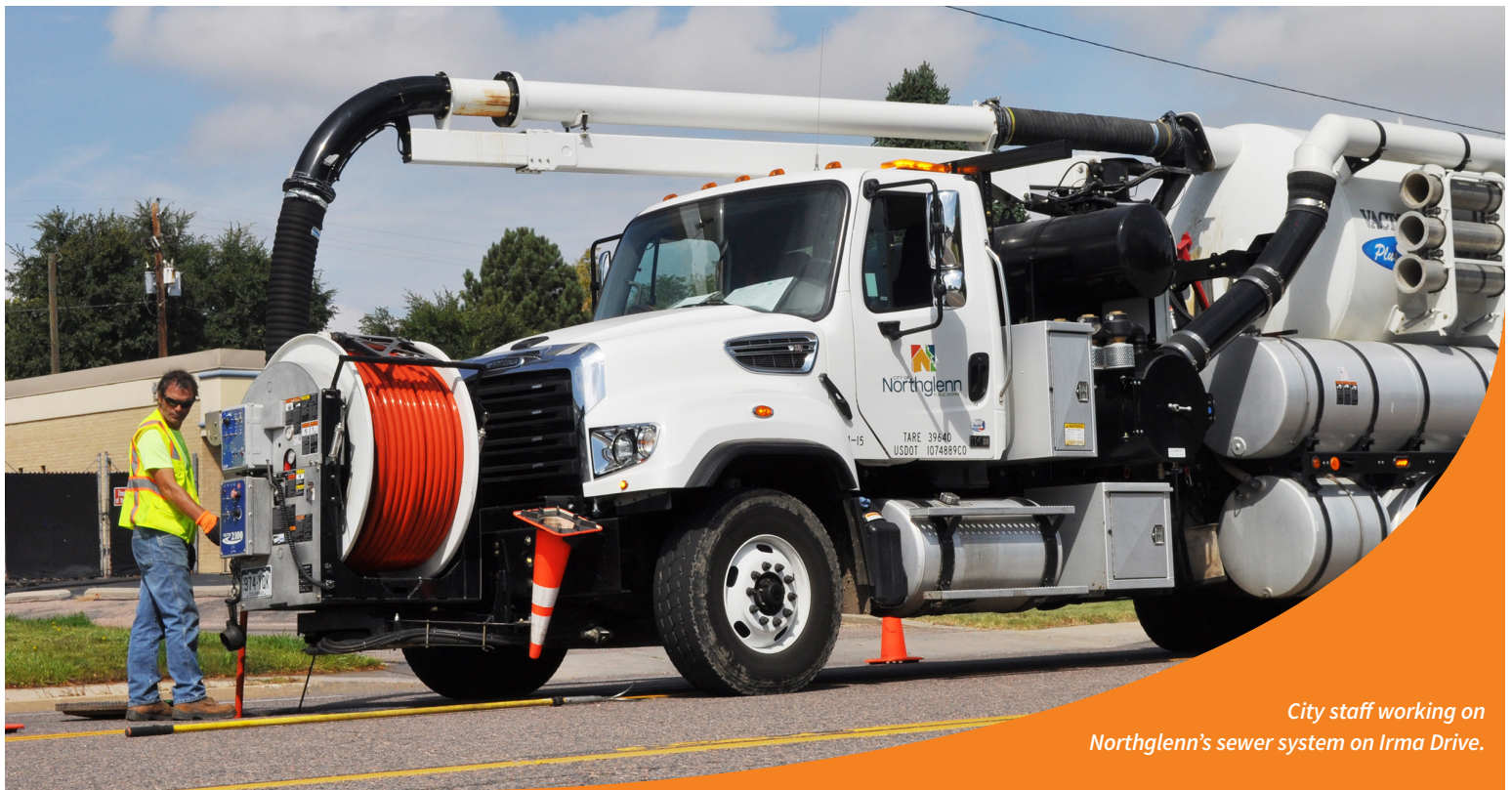
City staff working on Northglenn's sewer system on Irma Drive.

optimal level and meeting the needs of our community