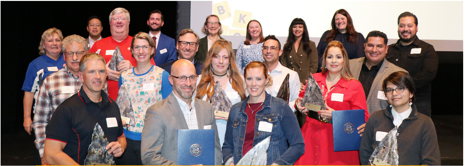
The annual Business Appreciation Event honors businesses and entrepreneurs that have excelled in Northglenn.